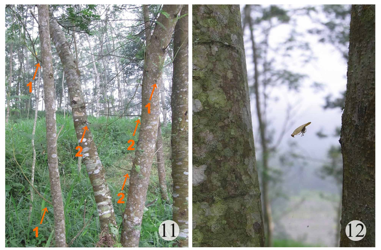
FIGURES 11–12. Habitat of P. merapiensis sp. nov. Web(s) of P. merapiensis sp. nov. under twigs (arrow 1) and dead branches (arrow 2) (11), and between tree trunks with a shelter (12) of Albizia falcataria .

Variation. The ground color of females is variable; some specimens are almost blackish brown, and some are yellowish brown. In dark specimens, flecks on the abdomen and legs are indistinct and the sternum has a pair of lateral, large dark flecks. In pale specimens, the longitudinal dusky flecks on the legs are indistinct. The ground color of males is not so variable. Measurements (in mm, Q/Q): Body length 4.5-6.7/2.5–3.1; carapace length 1.9–2.3/1.2–1.5; abdomen length 2.5–4.8/1.4–1.7.