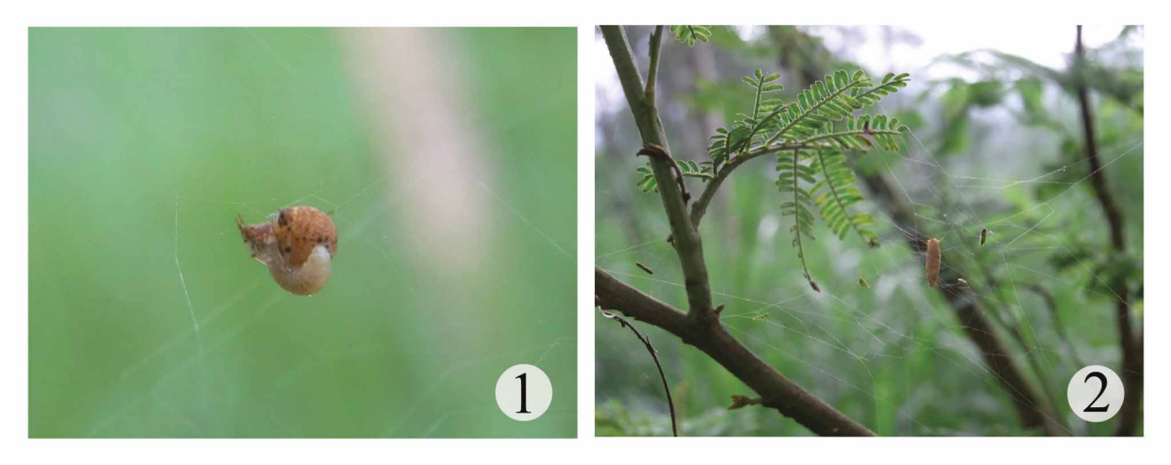
FIGURES 1–2. A larva of Z. albicoxa on a juvenile P. merapiensis sp. nov. (1); A cocoon hanging from web of P. merapiensis sp. nov. (2).